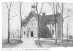
First Hebron High School

Our schools' rating by www.greatschools.net