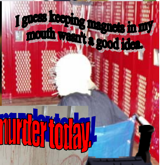
I guess keeping magnets in my mouth wasn't a good idea.