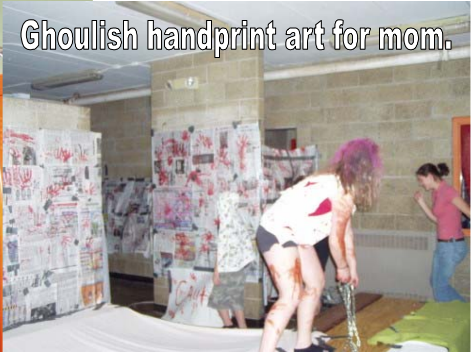
Ghoulish handprint art for mom.