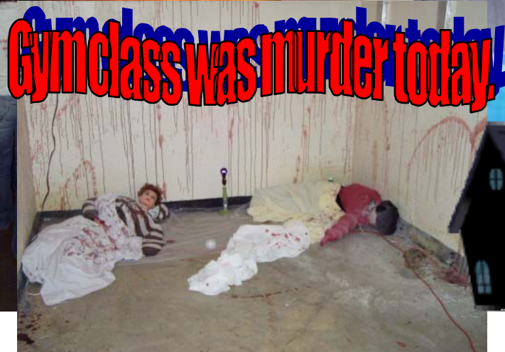
Gym class was murder today!