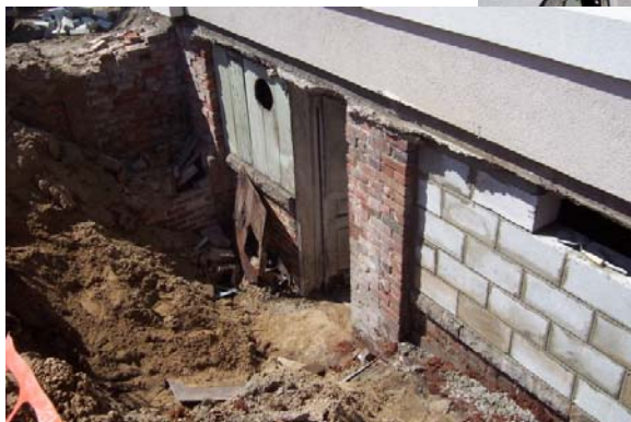
Sealing up the holes before filling this back in.