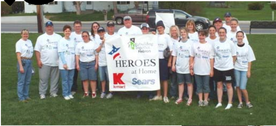
Our volunteers for the Sears Heroes at Home project.