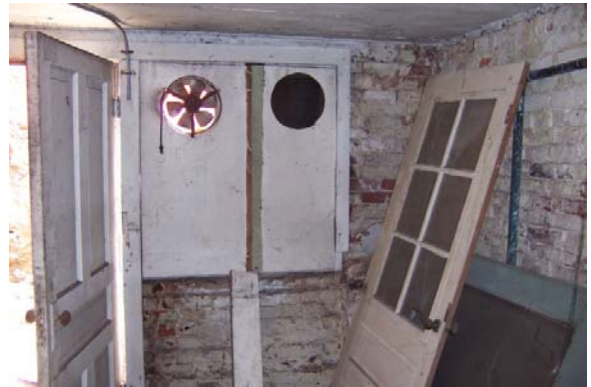
From the inside looking toward Main Street. This hasn't seen the light of day in how long?