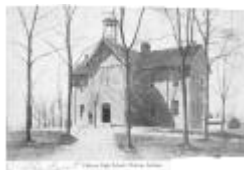
First Hebron High School

Our schools' rating by www.greatschools.net