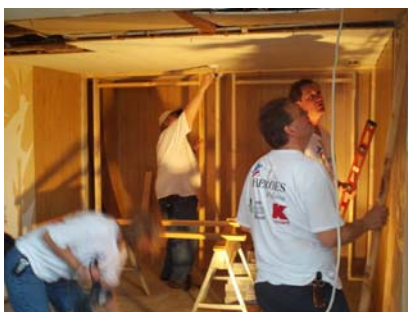
The Sears Heroes At Home Project gets an entirely new basement bedroom addition.