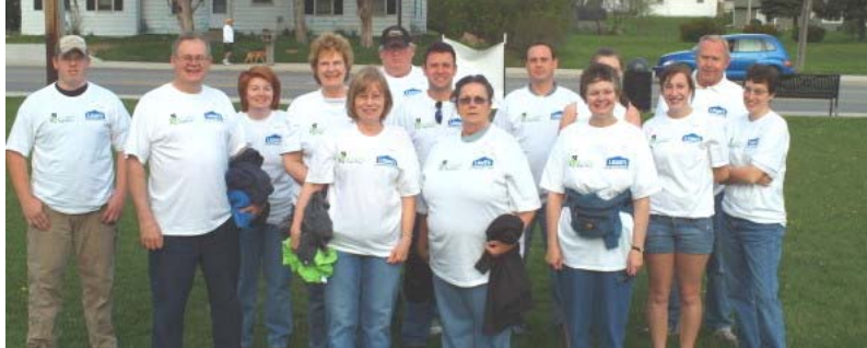
Our volunteers on the Lowe's Project