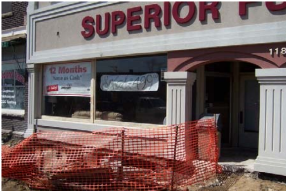
The location of the basement under the big window