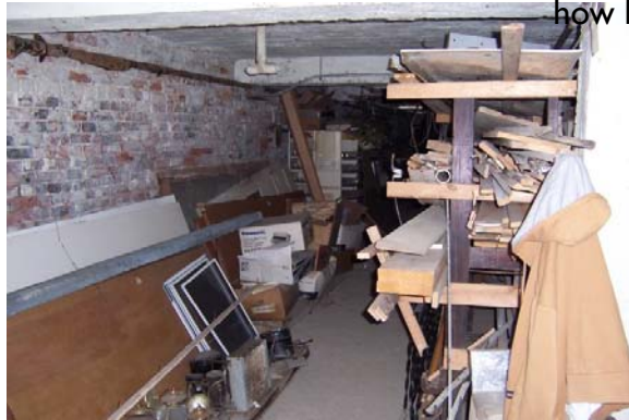
Inside is being used for storage. Notice the charred brick on the wall.