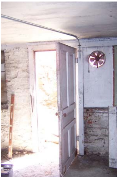
Looking out the door toward Main Street.