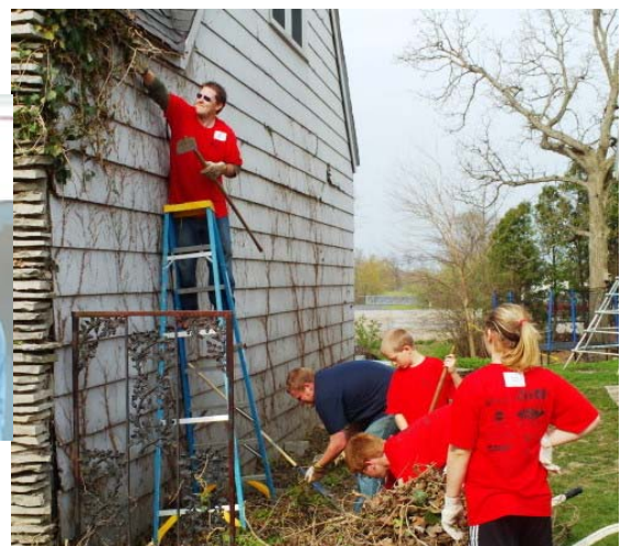
The kids were very helpful in getting the projects done this year.