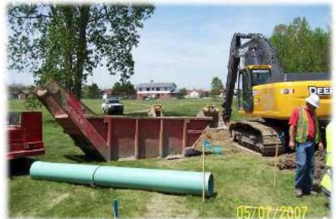
The new pond is on a truly grand scale. You can see the apartment building behind here, which should have some interesting new views in the next month. Waterfront property?