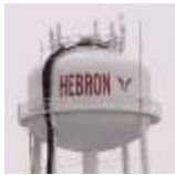
Our newly renovated Water Tower

We make Hebron the great town it is together.