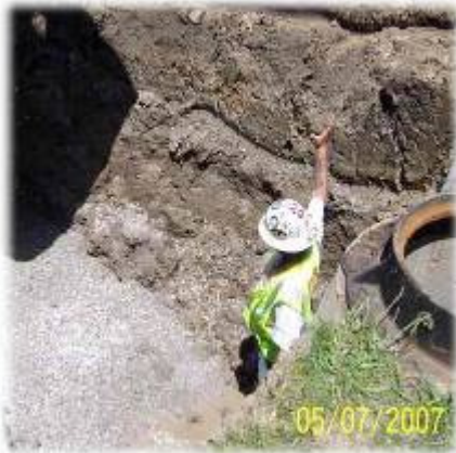
Getting ready to place the new sewer pipe on a bed of gravel