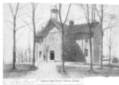
First Hebron High School

Our schools' rating by www.greatschools.net