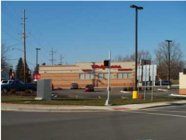
Our new Walgreens opened and was packed to the gills throughout the holiday season.