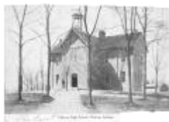
First Hebron High School

Our schools' rating by www.greatschools.net