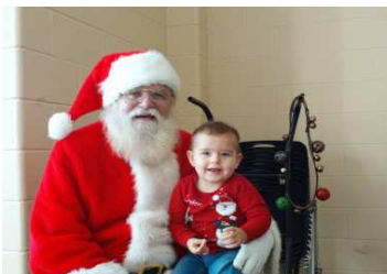
Doesn't that cute face make you smile, too?

Santa was a big hit, as in every year. This year, he brought the sleigh bells from one of his reindeer for the kids to ring and play with. Many children whispered their wishes to Santa