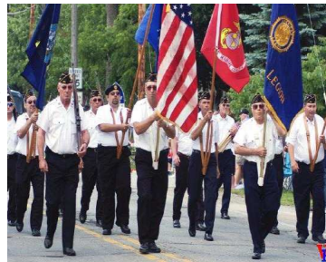
The Chamber's big event—the 4th of July Parade and Fireworks.

The Chamber is looking forward to a great 2009 with many new ideas to improve our town of Hebron and help our businesses. The Chamber plans to sponsor a "2009 Meet the Chamber Night" for local business owners. The event in April, 2008 was a great success; the business owners who attended learned of the future plans for Hebron and the Major Moves Project.