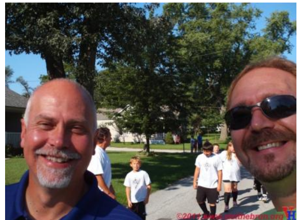
Hebron Soccer's U12 Girls Team getting ready to march.