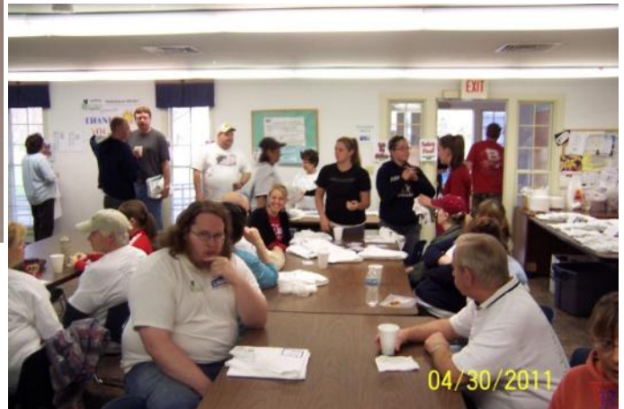
The kickoff meeting is more thrilling than this picture would portend.... Really.....