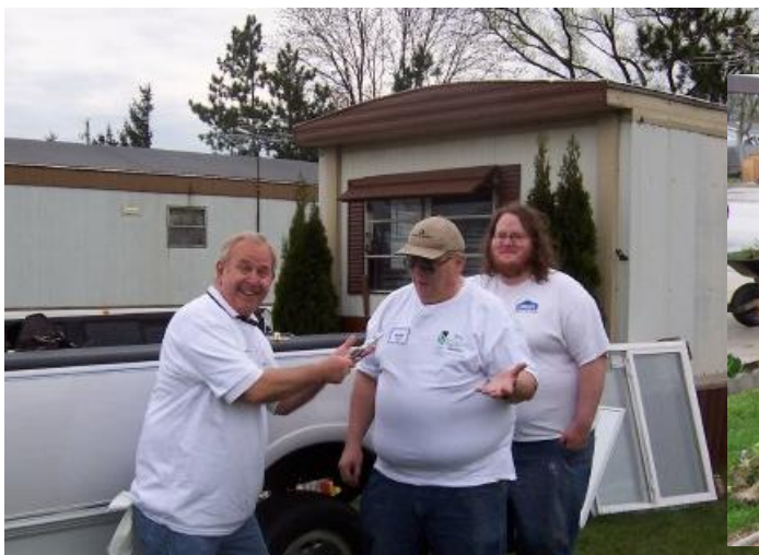
Seriously, work does actually get done when the clowning around is done. Don't tell these guys that, though.