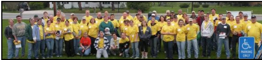
Rebuilding Together Hebron crew; April