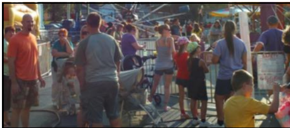
Summer Fun Days; June