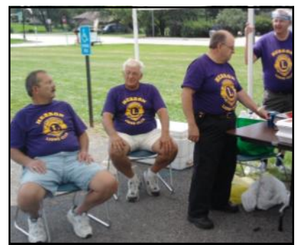
Lion's Club Port-A-Pit Chicken sale; August