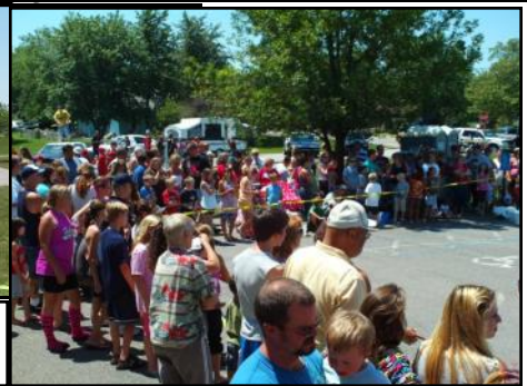
4th of July Carnival; July