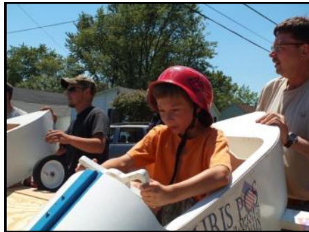
Soapbox Derby; July