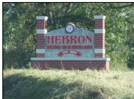
Gateway Signs; October