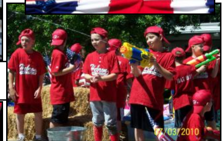
4th of July Parade