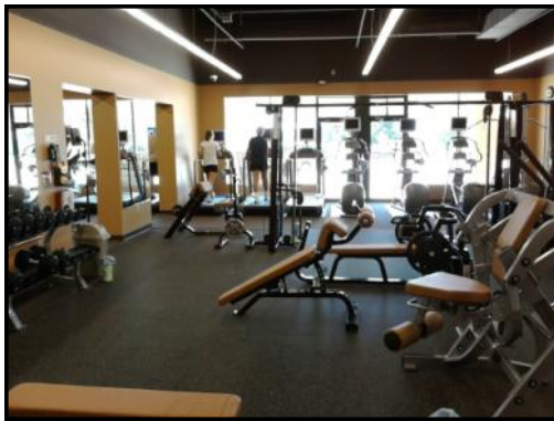
Anytime Fitness opens; June.