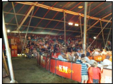
Lion's Club Circus; August