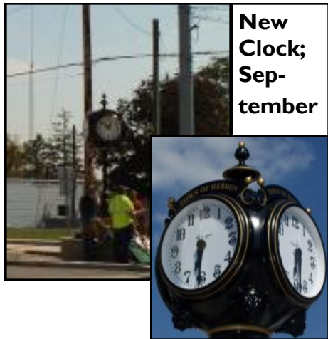
New Clock; September