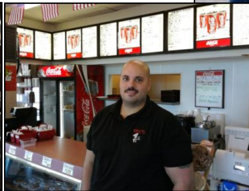
Pav's opens; June