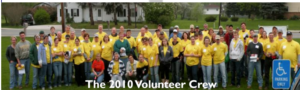
The 2010 Volunteer Crew