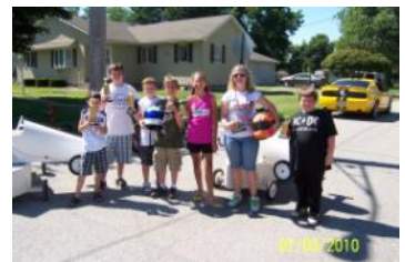
Some finalists at the Soapbox Derby from 2010