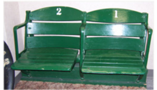
These seats are in Mr. Walker's room and are from Wrigley Field back in 1986 when they were removed from the upper deck. The kids get to sit in them as a reward or just when free time comes about.