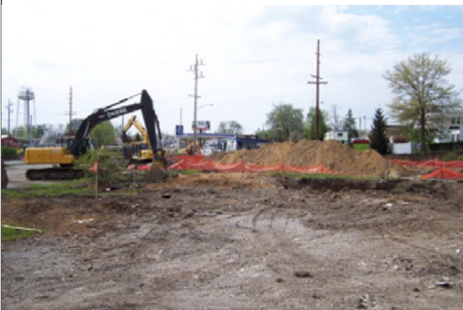
Site work on the new Walgreen's store location is heavily underway here.