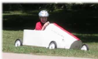
The Walgreens car discovered its

The Top 3 finishers from each class will get the chance to ride on the Park Board's float in the parade on the 4th of July. Every year, the kids have a great time and the spectators bring their lawn chairs and have a relaxing summer day watching them have fun. Please join us. Parking is available on streets around Cohen Park.