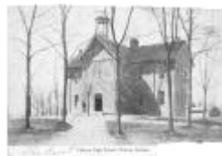
First Hebron High School

Our schools' rating by www.greatschools.net